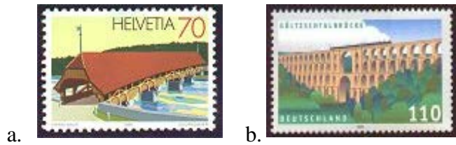
Figure 7 Wooden and masonry bridges. a. Neubrügg bridge. (Switzerland 1535) b. Göltzschthalviadukt Mylay (Germany 1850)

About the middle of the 18th century bridge construction began to assume a more scientific aspect than before. Production of iron and steel in commercial scale gave new possibilities. Bridge building activity increased rapidly with the introduction of the railway all over the world