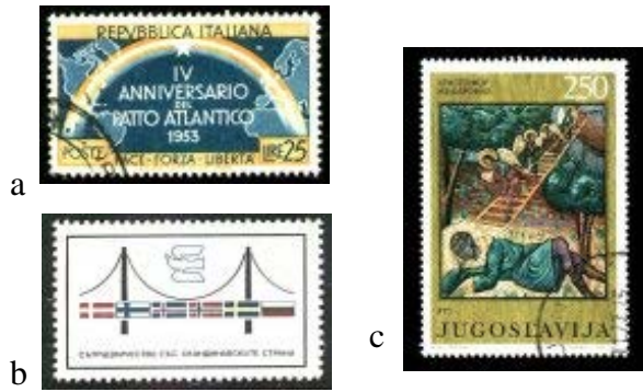
Figure 2. Bridges as symbols. a. Rainbow. b. Suspension bridge with flag girder c. Jakobs dream. Stairway (bridge) from earth to heaven.

religions. In Jakobs dream in the Bible, we find the stairway (bridge) from earth to heaven. (1c).