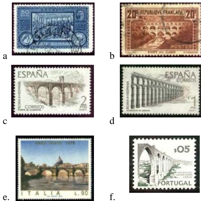
Figure 3 Roman bridges a. Roman wooden bridge (99BC from Trajan column) b. Pont du Gard ,Nimes, France (18 BC), c. Ponte di Trajano, Spain (98-117 AD). d. Aqueduct Segovia, Spain (100 AD) e. Ponte Saint Angele, Rome, Italy (134 AD) f. Aqueduct Das Aquas Livres, Lisboa, Portugal.

The Roman period was a peak in the history of bridge construction. A necessary condition for the efficient governing of the Roman Empire was good communications. As a consequence of this, the art of bridge construction showed an impressive development. The roman attained an extremely high technical level and still today, we can admire, and even use, the viaducts and aqueducts built 2000 years ago (Figure 3). Today