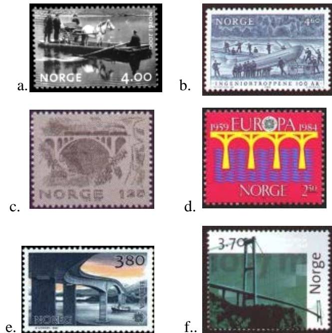
Figure 16 Norwegian bridge building. a. Need for bridges. Ferries were used to cross water. b Military floating bridges, c. Kylling bridge d.. Symbolic bridge European community. e.. Herøy bridge (1976) f. Askøy bridge. (1992)

During the period 1960-1980, there was an increase in bridge building activities. The free cantilever concrete beam bridge was a competitive and frequently used type used across the Norwegian fjords. Typical example from this period is the Herøy bridge (16e) built in 1976 with a span width of 170 metres.