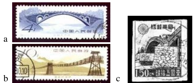
Figure 4 Chinese and Japanese bridges a. The An-Chi bridge China (610), b. The An-Lan bridge China (610). c. Kintaibashi Bridge (Japan 1677).

China has a long tradition in bridge building. Early Chinese bridges included stone and wooden bridges and rope bridges as well. Examples are given in Figure 3 and demonstrate the engineering skill. The An-Chi bridge across the river Chiao China, built in 610 AD and still existing, gain distinction by the shallow arch. (4a). The An-Lan rope suspension bridge in Kuanhsien China (4b) , built about 900 AD which has eight spans and a total length of about 325 meters, is a remarkable bridge. The Kintaibashi wooden arch bridge across Nishikigama in Japan (4c) built 1677 is typical for early Chinese and Japanese wooden bridg-