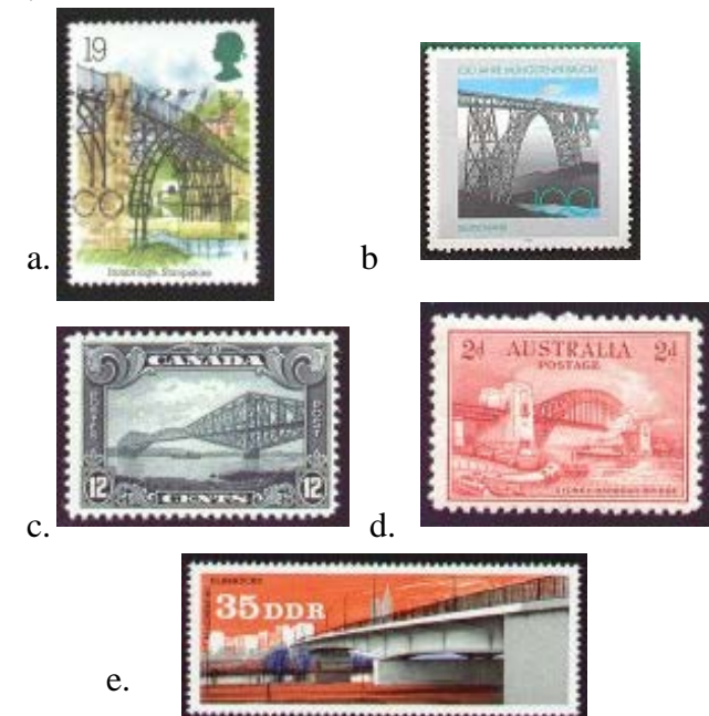
Figure 8 Steel bridges a. Ironbridge Shropshire, (GB) b. Münstener bridge (Germany 1897) c Quebec bridge (Canada 1918) d. Sidney Harbor bridge (Australia 1930) e. Steel plate girder bridge .

Most modern suspension bridge development has been done in the United States. The pioneer work by the Roeblings in the Niagara Falls Bridge and the Brooklyn Bridge (9c) finished in 1854 and 1883 started a new epoch, which culminated in the Verrazano-Narrows Bridge with a span width of 1298