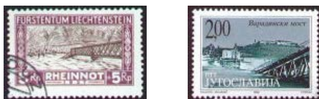
Figure 12 Bridge failures a. damage by nature. b. damage by war actions.

The collapse of Tacoma Narrows Bridge due to wind turbulence is perhaps the best-known bridge failure the last half century. 77 people died at the failure of the Tay Bridge in Scotland 1879, and during the building period of the Quebec Bridge 95 persons were lost. Recently historical bridges as the Stari Most bridge (5c) and other bridges (12b) in Yugoslavia were destroyed by war actions.