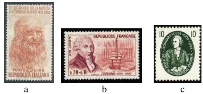
Figure 6 Representatives of the science of mechanics.

The origin of the science of mechanics was most likely at the time of Navier, just after the turn of the century 1700-1800. Before him there had, however, been a number of outstanding representatives of the science of mechanics, where names like Archimedes, Leonardo da Vinci, Galilei, Hooke, Bernoulli and Euler can be mentioned. (figure 6).