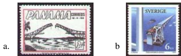
Figure 14 Bridges during construction a Thatcher Ferry Bridge (Panama 1962) , b. Øresund bridge (Sweden- Denmark 2000)

Different types of construction methods have been developed. Stone and concrete bridges have to be built on scaffolding, while steel bridges are manufactured and put together on site. Free cantilever building methods for steel and concrete bridges have been developed. Bridges have been pushed and floated into the right position, and installation techniques have been worked out for prefabricated bridge elements. Examples of bridges under construction are given in Figure 14.