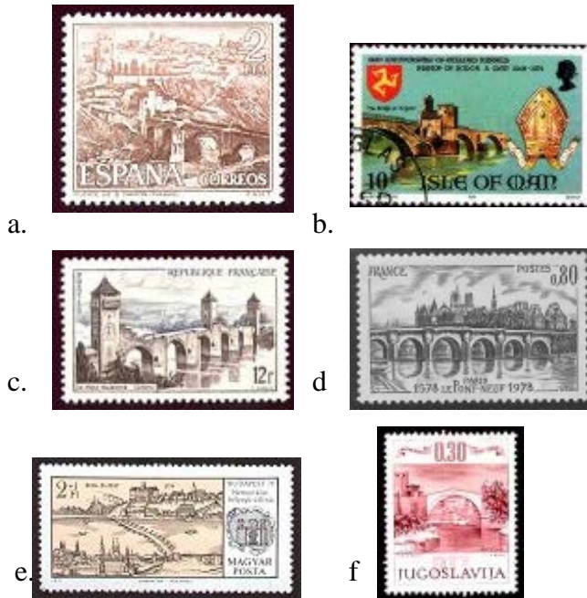
Figure 5 Medieval and renaissance bridges. a. St Martins bridge Toledo (Spain). b. Pont d'Avignon (France 1188). c. Pont Valentré (France 1308-1380). d. Pont-Neuf, Paris, (France 1578-1604) e. Floating bridge Budapest (Hungary) f. Stari Most Yugoslavia (1566, destroyed by war actions 1993)

With the emergence of the renaissance and modern times, the building of bridges flourished again. The establishment of trade routes and not least the growth of large cities, made bridges necessary. Le Pont-Neuf (5d) built in 1578-1604 which is one of the most famous bridges in Paris, may stand as an example of this period.