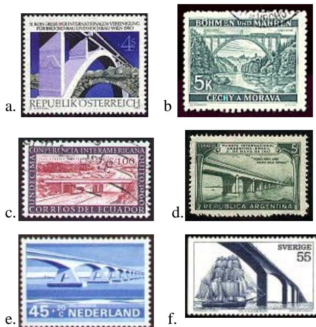
Figure 11 Concrete bridges. a. Stone and concrete arch, b. concrete arch. c.d Reinforced concrete beam bridges e. Oosterschelde Bridge (Netherlands 1965) f Øland bridge (Sweden 1972)

Reinforced concrete was competitive for small and large bridges. We find bridge structures like plates, beams and frames (11c,d). Introduction of prestressed concrete from about 1927 gave new possibilities of modern bridge design. The span widths became larger and rational building and production systems have been developed. Development in concrete material design during the last decade has allowed progress concerning strength and durability.