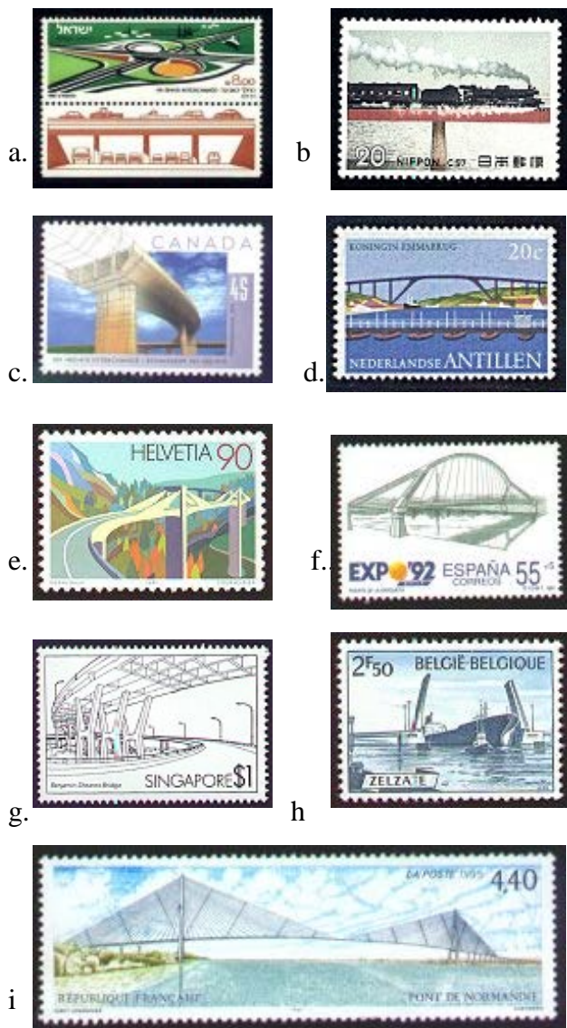
Figure 13 Examples of bridge types. a. Road bridge, b. Train bridge, c. Concrete bridge, d. Steel frame bridge and floatong bridge. (in front) e. Ganter bridge (Switzerland 1980) f. Alamillo Bridge (Spain 1992) g. Concrete truss bridge e h. Moving bridge. i. Normandy bridge (France 1994)

A classification of bridges is often made with respect to the user of the bridge, the material which has been used, the static system, the geometry, the construction method used or service life. Examples of bridge types are given Figure 13.