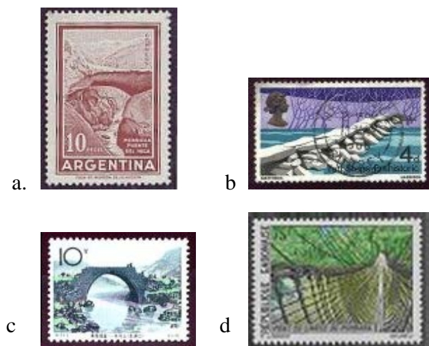
Figure 1 Natural and early manmade bridges. a Puente del Inca. Medoza. Argentinean natural bridge. b Tarr Steps England 1000 BC. c Chinese stone arch bridge d Gabon rope bridge.

Some examples of early bridges that exists today, are Tarr Steps in Exmoor, England (1b), built about 1000 BC, and an arch bridge across the river Meles by Izmir in Turkey, built about 850 BC.