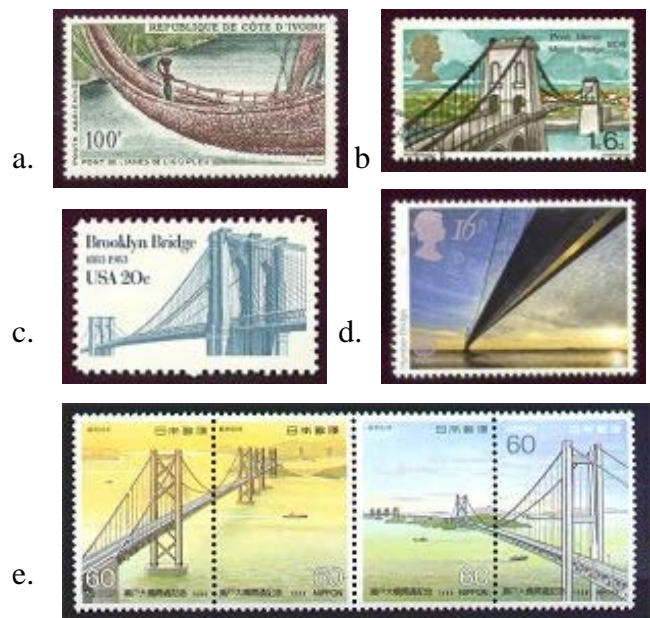
Figure 9 Suspension bridges a. Rope Bridge Ivory Coast b. Manai Suspension Bridge (GB 1826) c, Brooklyn Bridge (USA 1883), d. Humber bridge (GB 1981) e Seto Ohashi Bridges Japan 1988.