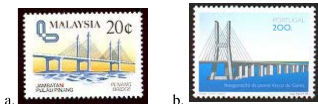
Figure 10 Cable stayed bridges a Penang Bridge, Malaysia, b. Ponte da Vasco da Gama, Portugal (1998)

Cable-stayed bridges are competitive for road bridges with span widths of 200-500 m. With respect to span widths they fill the gap between the suspension bridges and large prestressed concrete bridges or steel plate girder bridges.